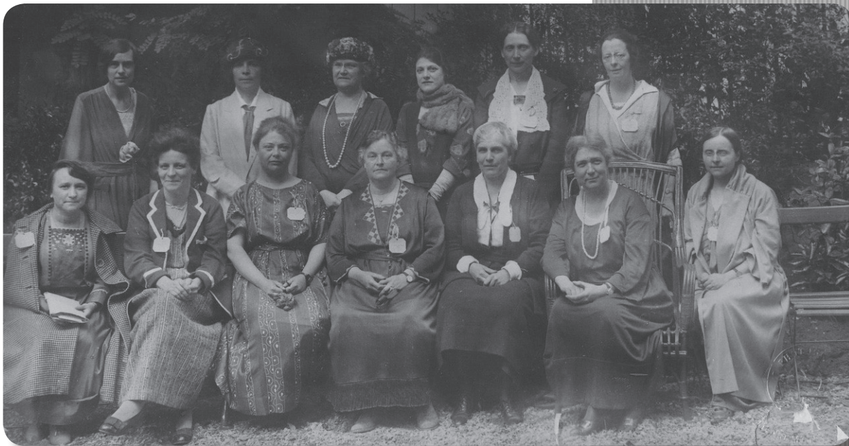
IFUW Council 1922