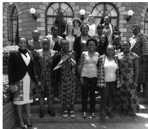
Members of the Ghana Association of University Women

She has also presented papers at IFUW and GWI conferences in Perth, Manchester, Mexico, Cape Town and Geneva on local concerns of Ghanaian women and how they were solved.