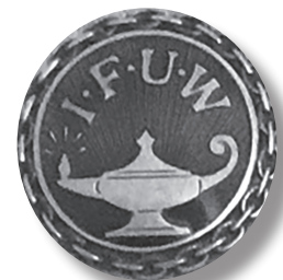
IFUW brooch 1924

The lamp of wisdom. A burning lamp spreading light and wisdom to all women, surrounded by a closed chain symbolizing the bond of friendship